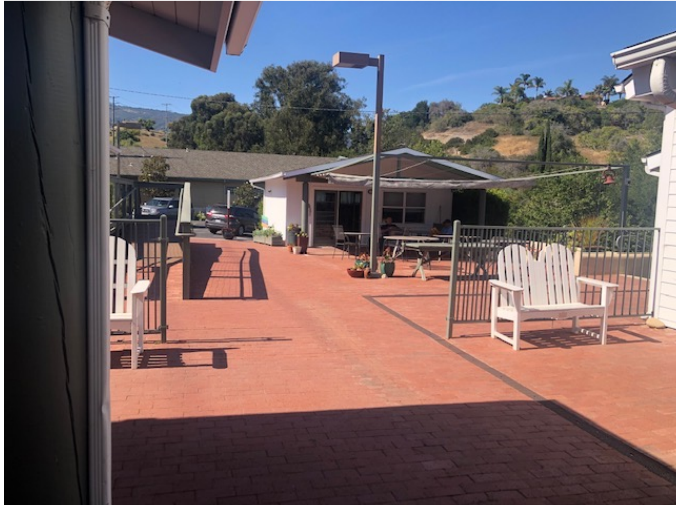
The outdoor patio area