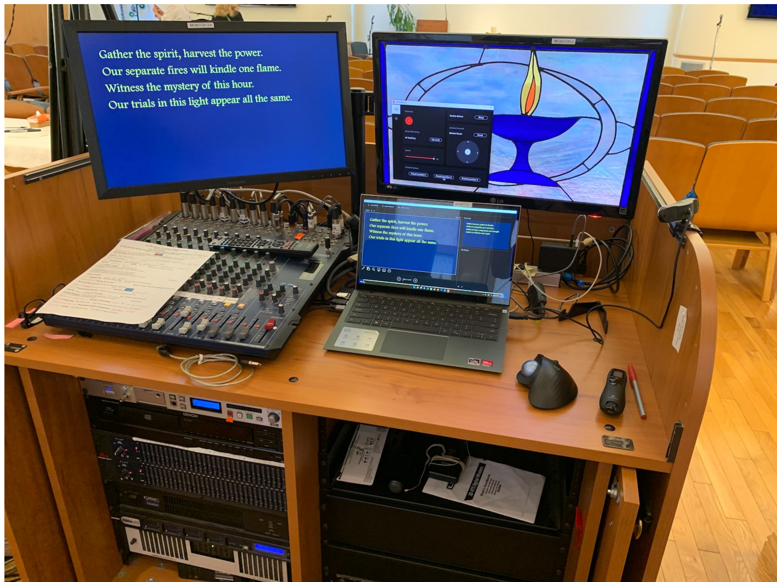
Here is the AV setup in the back of the room with one of two video cameras.