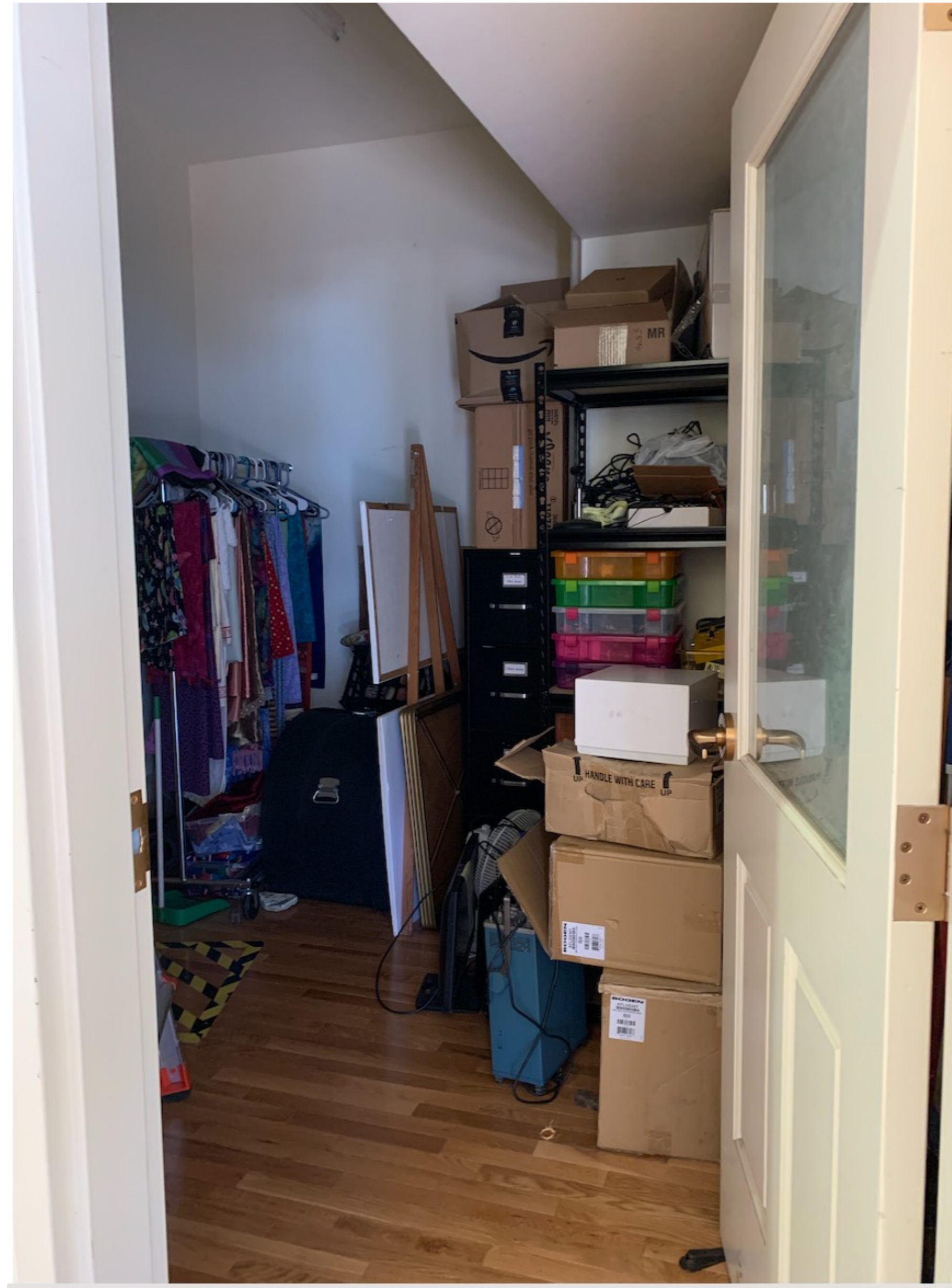
A storage closet is big enough for the library carts