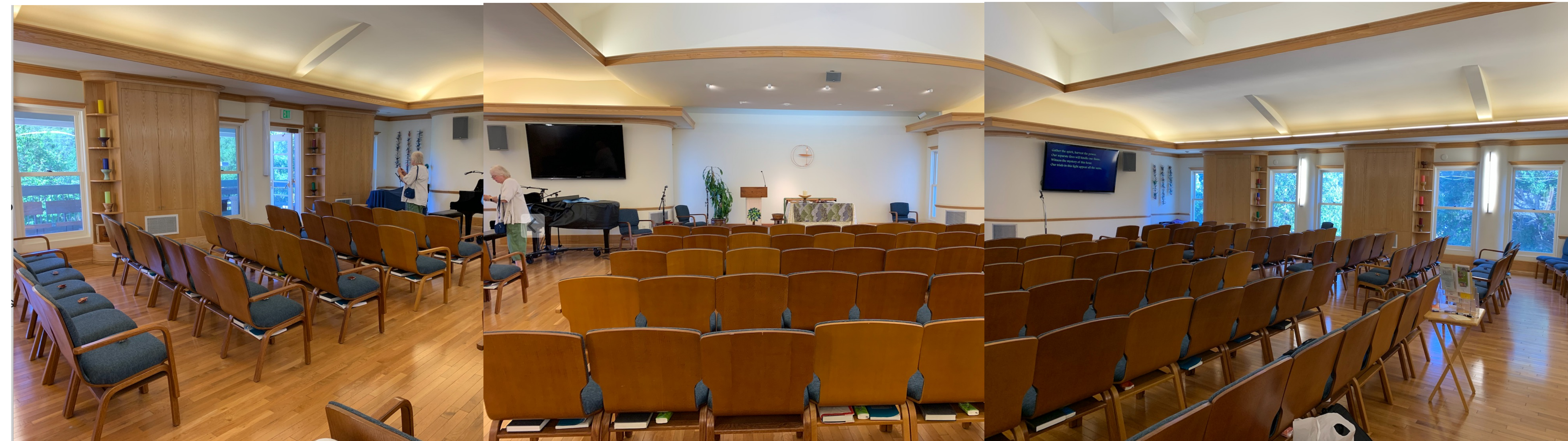
This is a composite photo of the Sanctuary. Note the two video screens.