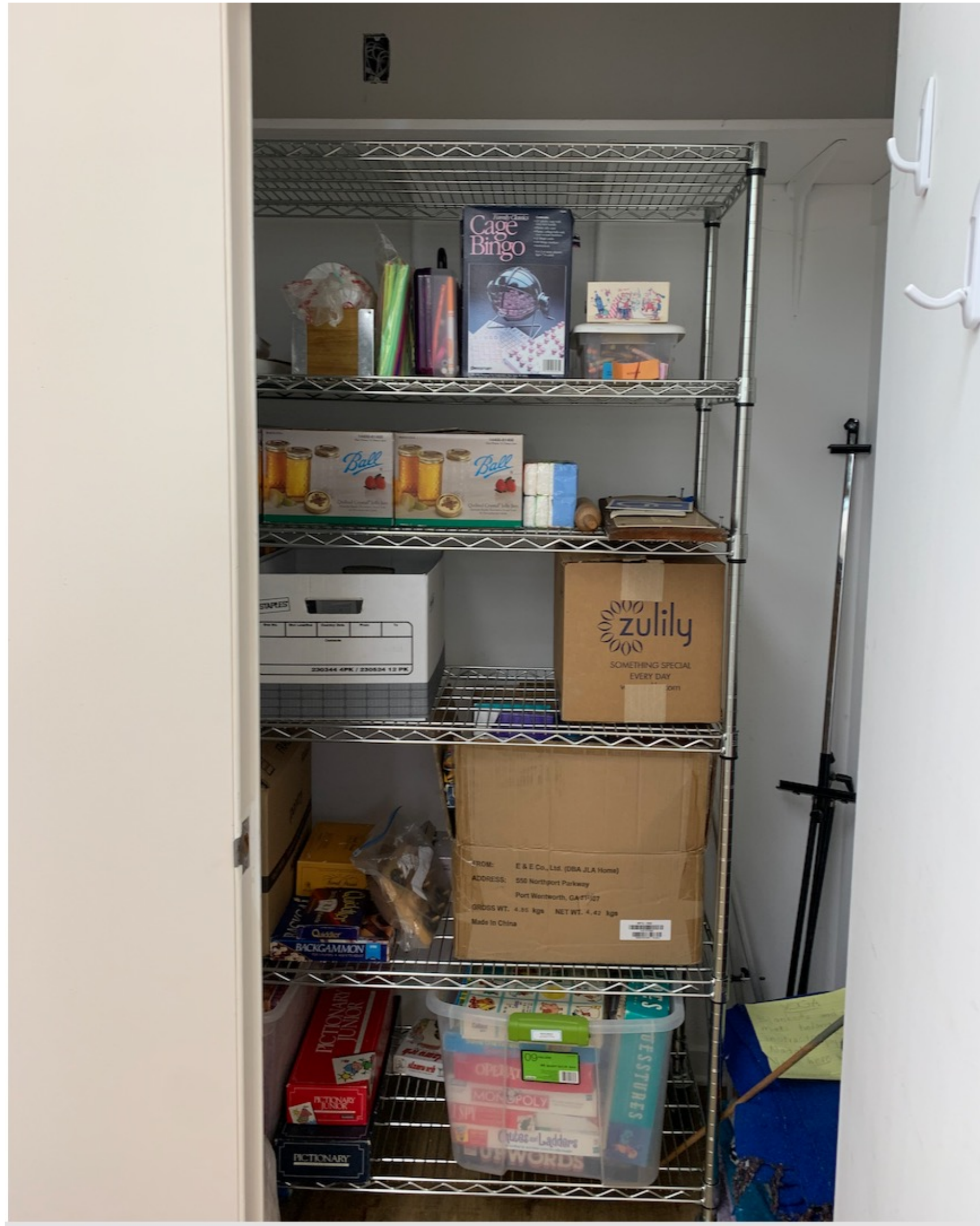
Small item storage