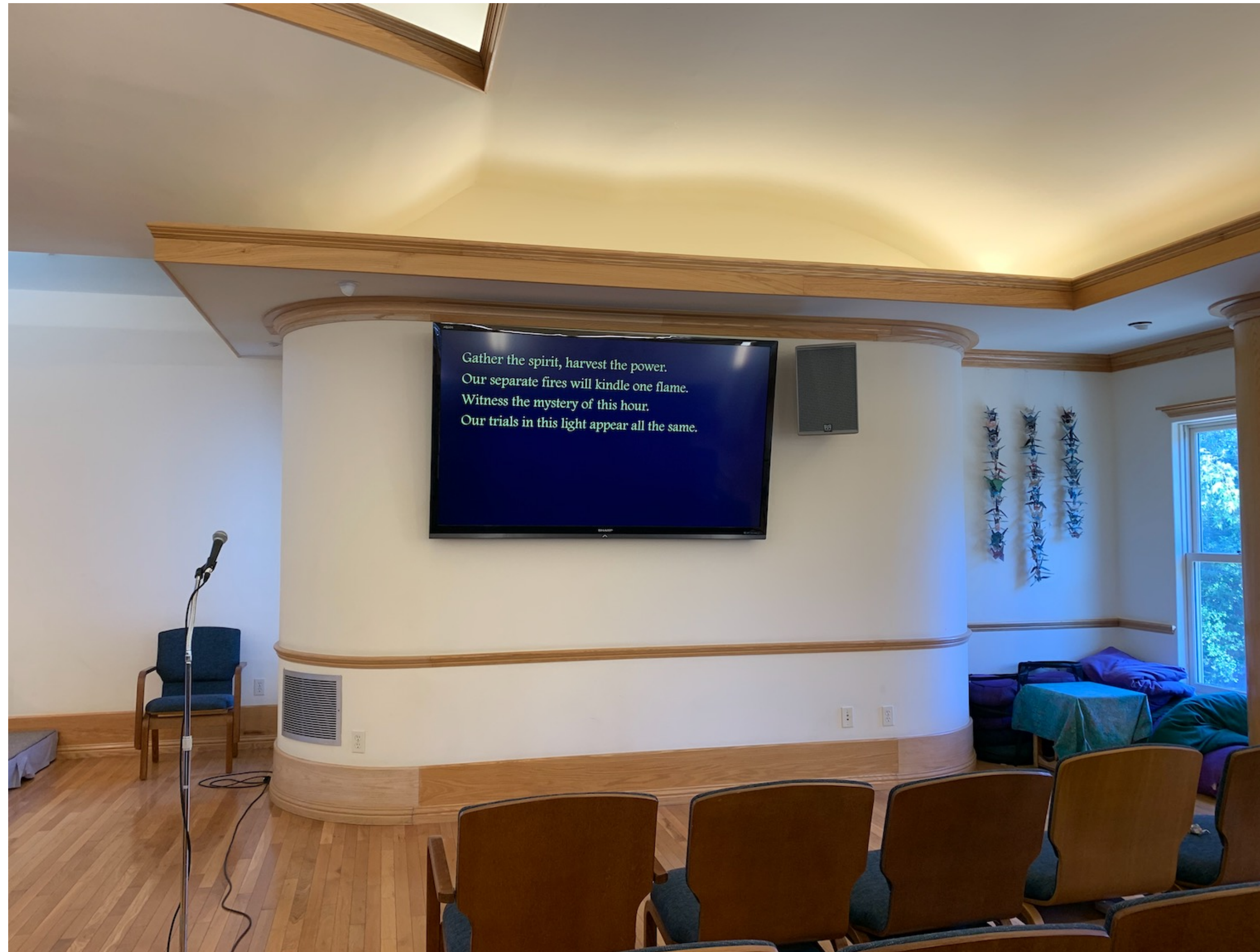
Large screens are permanently mounted to the walls