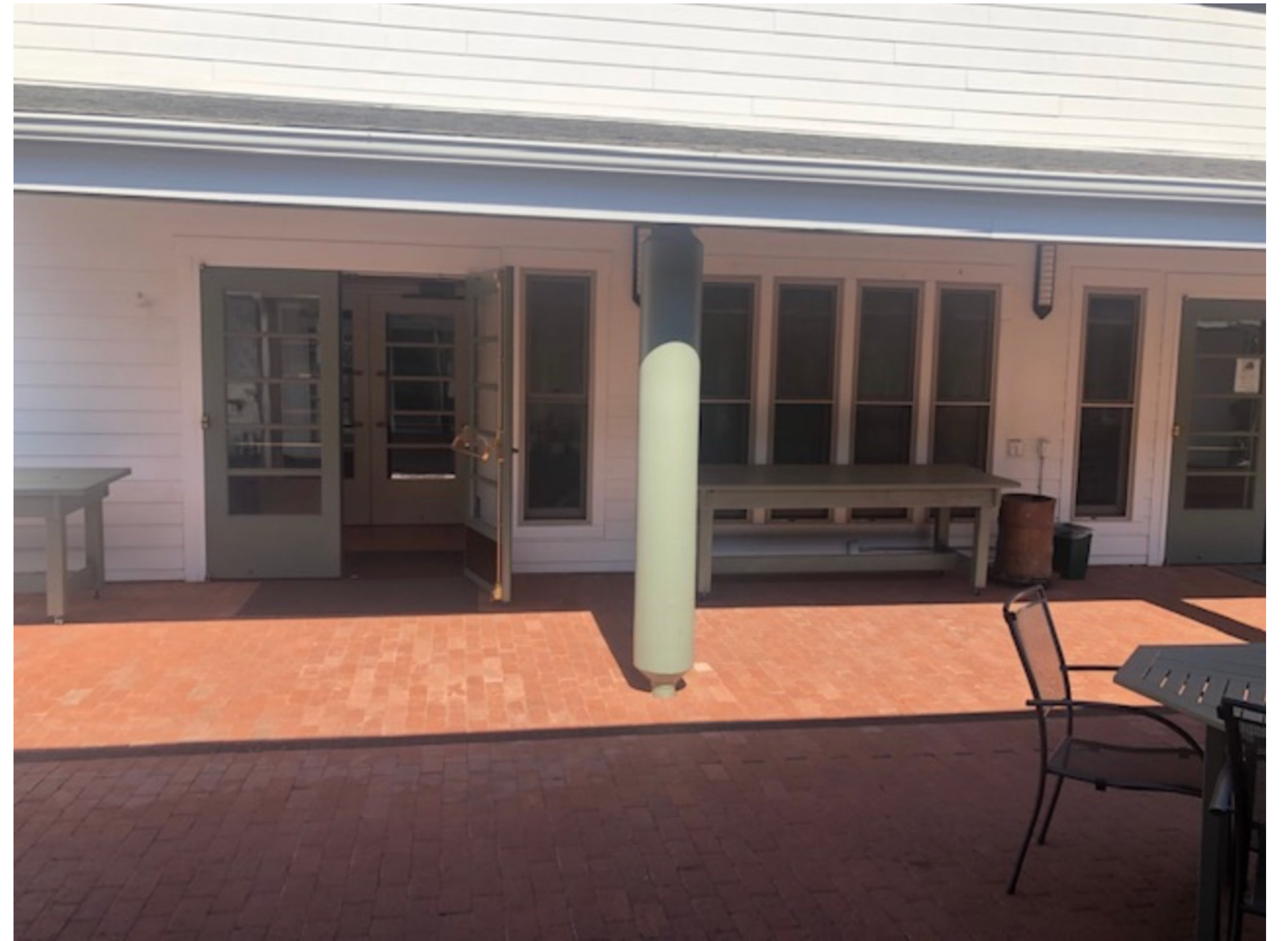
The entrance to the Sanctuary