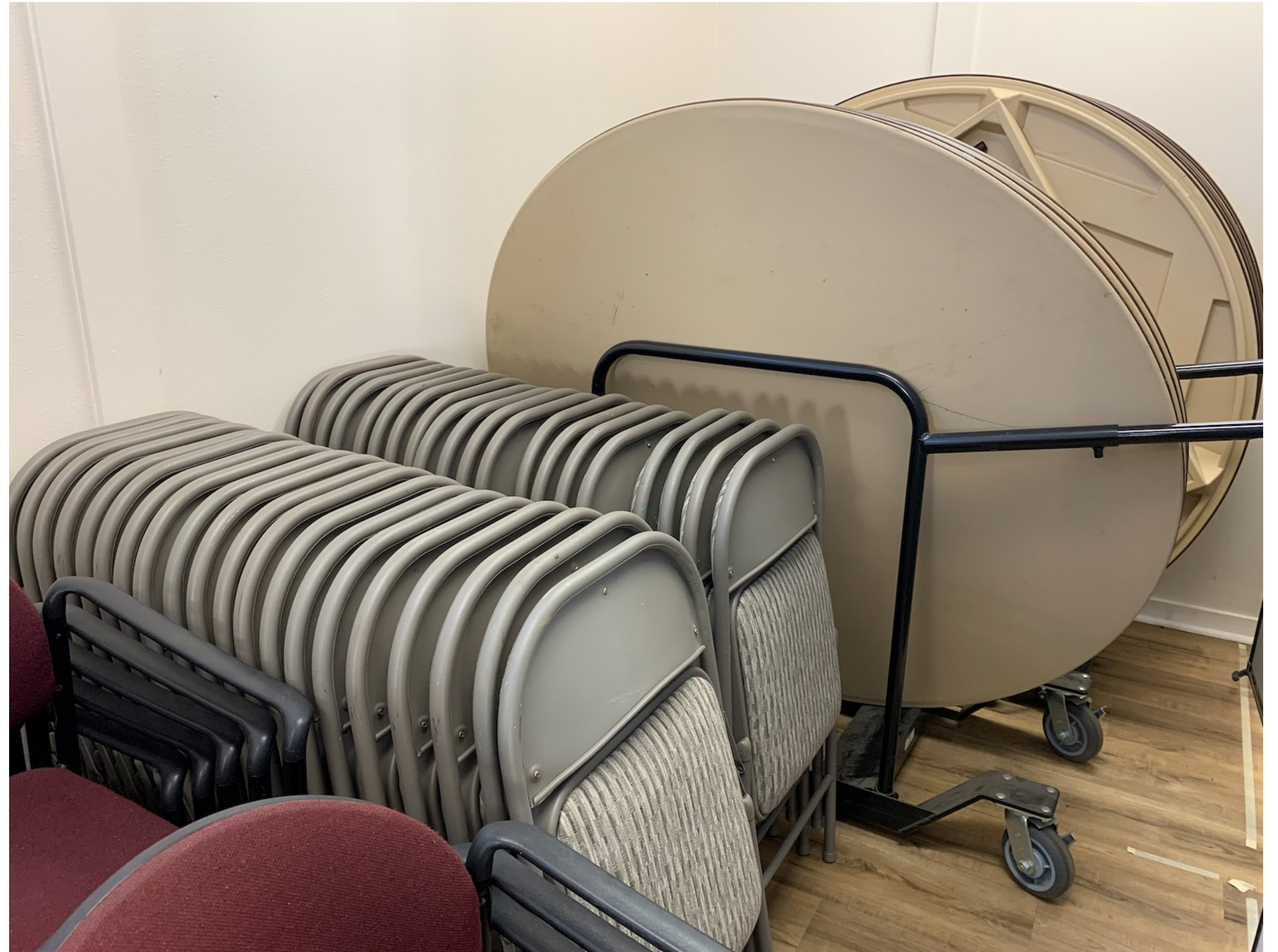
Chairs and tables are available